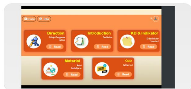
Figure 3: Menu Page

Based on Figure 2, this is the welcome page, to enter the main menu page we should write our name and school then, we should click the Save and Next button.