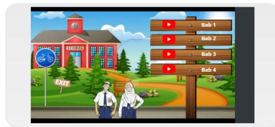
Figure 4: Material Page

Based on Figure 3, after we click the start button we will enter the main menu page as shown above.