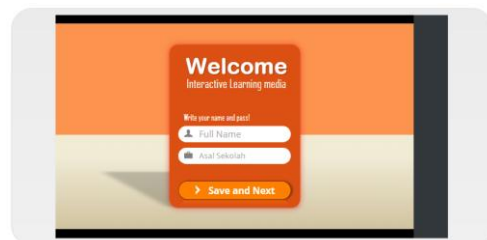
Figure 2: Menu Login/ Welcome Page

This stage is the creation of all multimedia objects based on the design that has been done. The background creation process in this application is designed using the Canva application, after the background is created, it can be directly imported into the articulate storyline 3 application. Meanwhile, the navigation buttons in this application are made by utilizing vectors that have been published on the website. Generally, the layout of the English interactive learning media is divided into some pages. Those pages are welcome page, main menu, materi, creator, information about apps, direction, introduction, KD and indikator, material, and quiz.